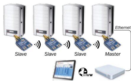
Replacing RS485 inverters interconnections