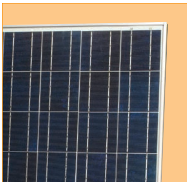
Solder-coated grid results in high fill factor performance under low light conditions.