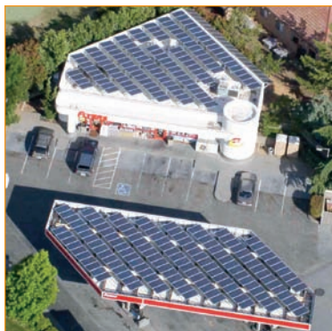
Sharp multi-purpose modules offer outstanding performance for a variety of applications.